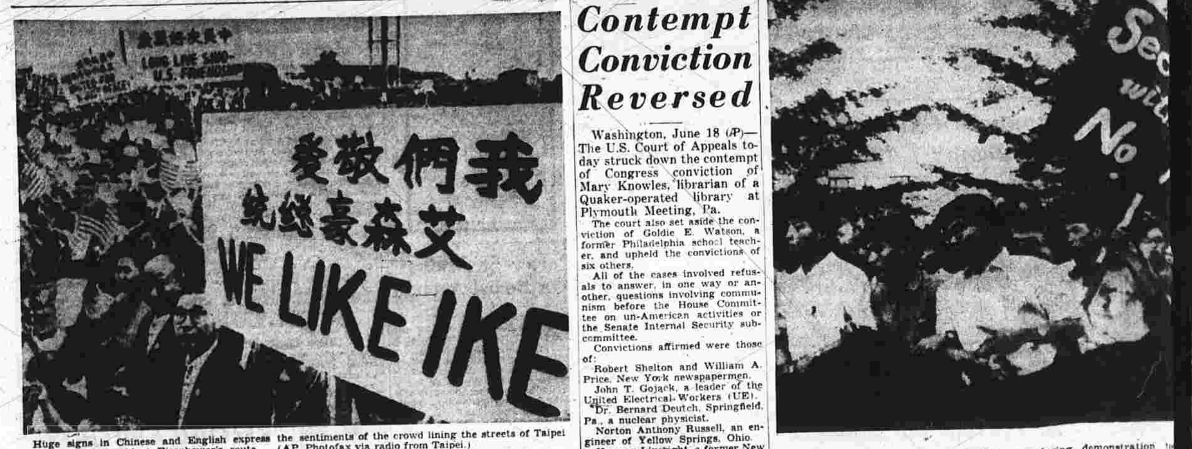
Huge signs in Chinese and English express the sentiments of the crowd lining the streets of Taipei today along President Eisenhower's route.